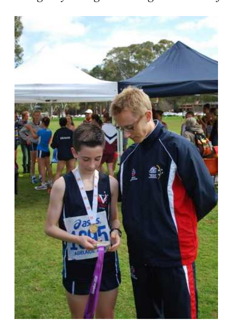
Kyle Swan gets a close up look at Jared Tallent's Olympic silver medal from London

by countless parents and fans (including me). Jared and Claire, along with all the AIS athletes are great ambassadors for the sport. It is always fantastic to see those guys and girls come to see the NEW generation. It was also good to see the WA team, also being very strong and taking their share of the loot.