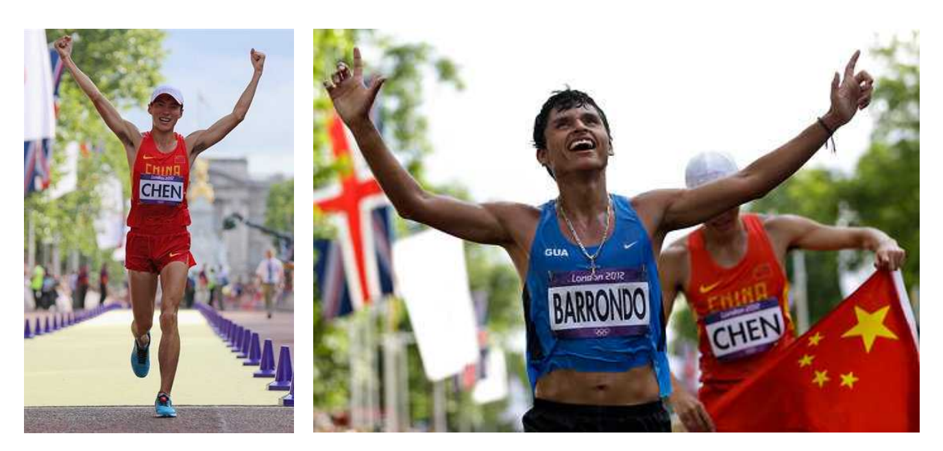
Chen and Barrondo celebrate their medal winning races