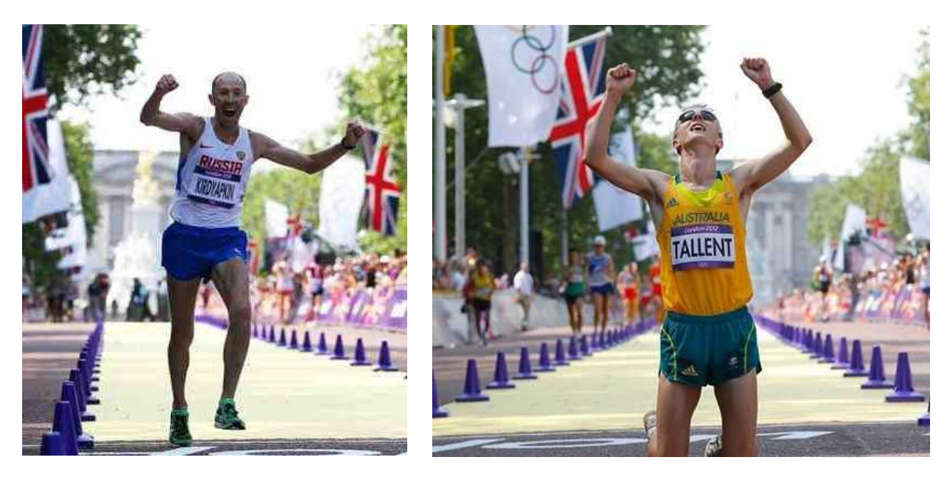
Delight for Kirdyapkin and Tallent as they cross the line in London

was the IAAF World Champion and world record holder - to be able to perform like that after nearly 4 years out with serious injuries was truly amazing. And Luke Adams , also returning after a serious leg operation, also put himself on the line, going out hard and lasting in the lead group for 25km (passed in 1:49:27) before slowing. Like Nathan, retirement was not an option and he gutsed it out to finish 26<sup>th</sup> in 3:53:41. We can be really proud of our three 50km contestants - an awesome team performance.