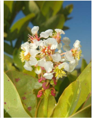
125 Byrsonima umbellata