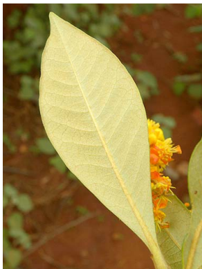
107 Byrsonima sericea