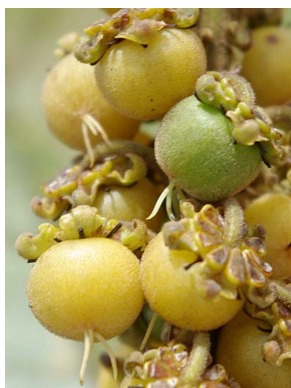
78 Byrsonima linguifera