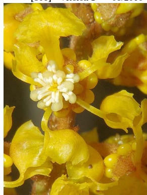
65 Byrsonima lanulosa