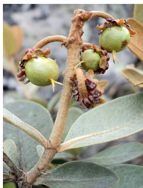
52 Byrsonima dealbata