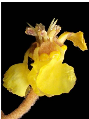
116 Byrsonima stannardii