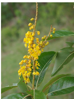
67 Byrsonima laxiflora