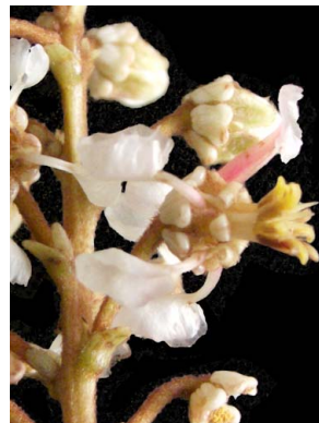
129 Byrsonima vacciniifolia