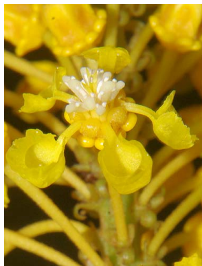
42 Byrsonima crispera