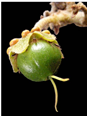
117 Byrsonima stannardii