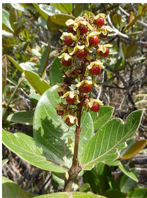
17 Byrsonima chalcophylla