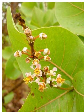
27 Byrsonima coccolobifolia