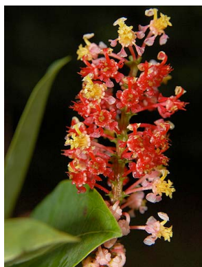
56 Byrsonima incarnata