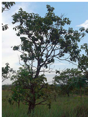
37 Byrsonima crassifolia