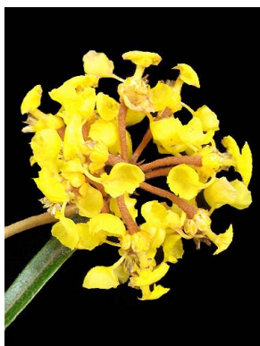
73 Byrsonima linearifolia