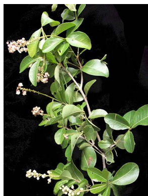
53 Byrsonima gardneriana