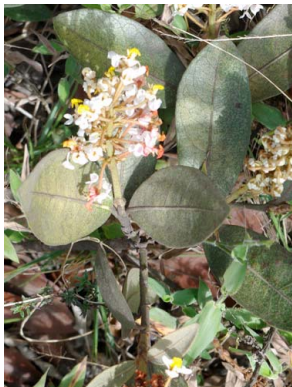
132 Byrsonima variabilis