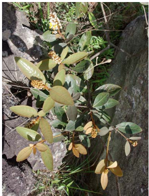
131 Byrsonima variabilis