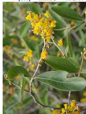
45 Byrsonima cydoniifolia