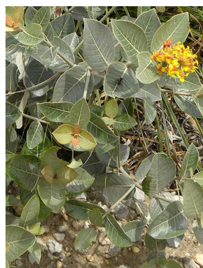
49 Byrsonima dealbata