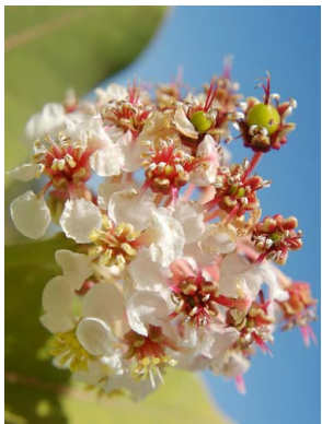
126 Byrsonima umbellata