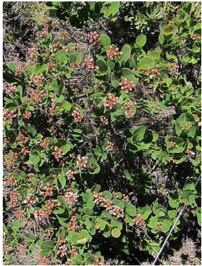
121 Byrsonima triopterifolia

Research support from CAPES and CNPq. This study is part of the doctoral thesis of the first author at the Instituto de Botânica. [fieldguides.fieldmuseum.org] [806] version 1 08/2016