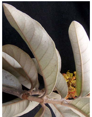
115 Byrsonima stannardii