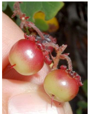
90 Byrsonima microphylla