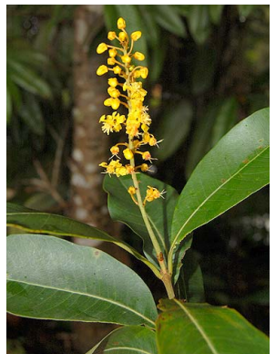
110 Byrsonima spicata