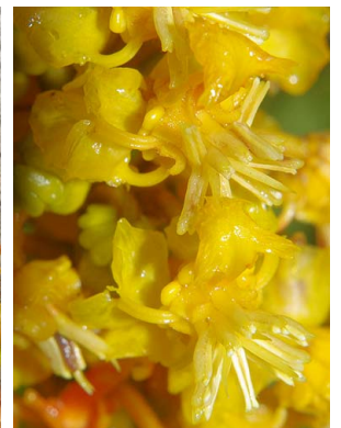
20 Byrsonima chrysophylla