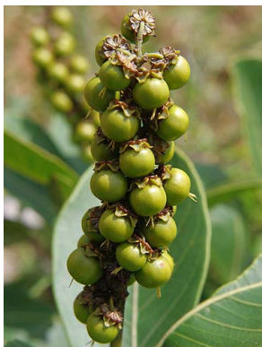
62 Byrsonima intermedia