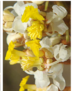
135 Byrsonima variabilis