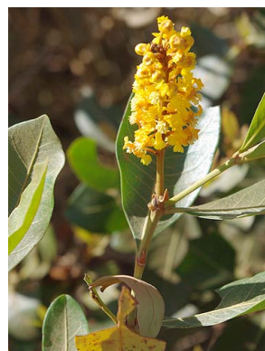
60 Byrsonima intermedia