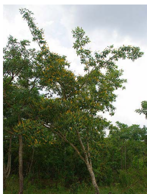
66 Byrsonima laxiflora