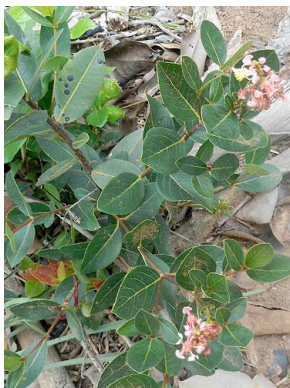
97 Byrsonima rigida