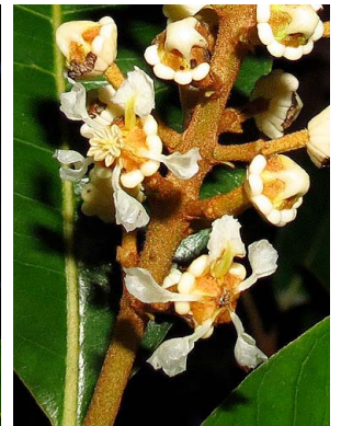
15 Byrsonima cacaophila