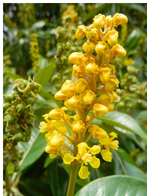
119 Byrsonima stipulacea