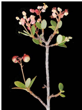
88 Byrsonima microphylla