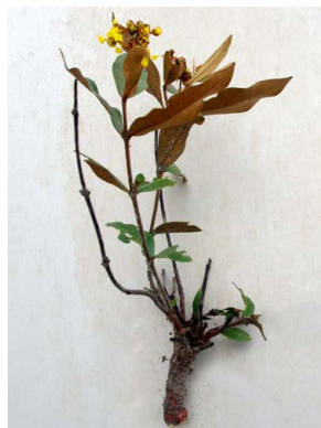
138 Byrsonima viminifolia