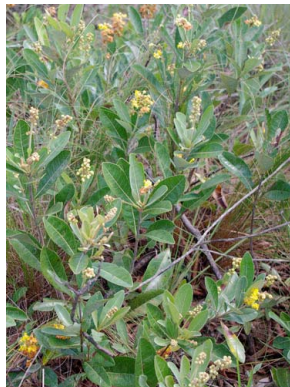
94 Byrsonima psilandra