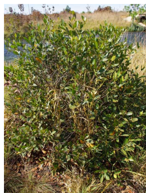
59 Byrsonima intermedia