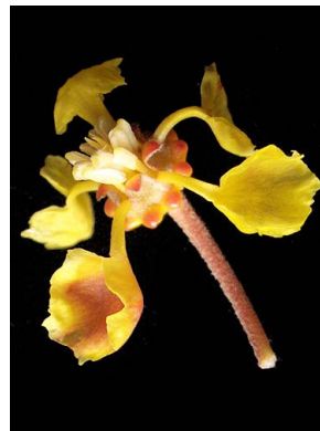
9 Byrsonima basiloba