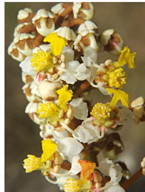
134 Byrsonima variabilis