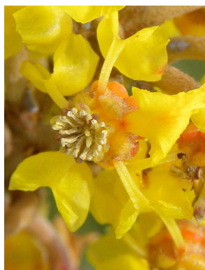
51 Byrsonima dealbata