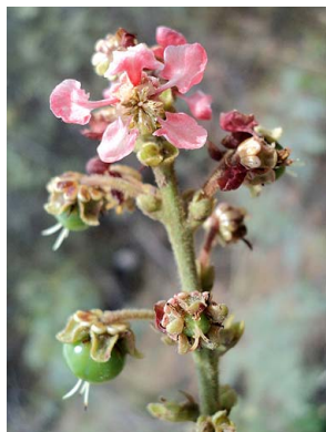
36 Byrsonima correifolia