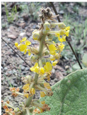
137 Byrsonima verbascifolia