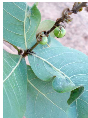
30 Byrsonima coccolobifolia