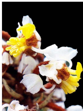
23 Byrsonima cipoensis