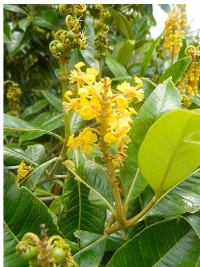
118 Byrsonima stipulacea