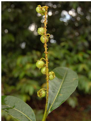
112 Byrsonima spicata