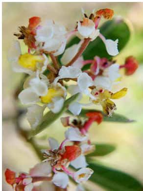
11 Byrsonima brachybotrya