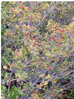
87 Byrsonima microphylla