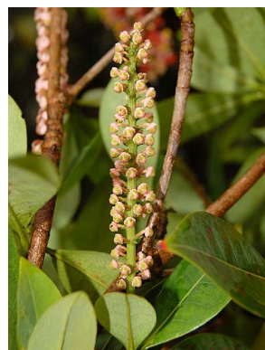
55 Byrsonima incarnata