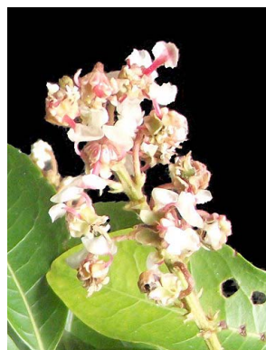
54 Byrsonima gardneriana