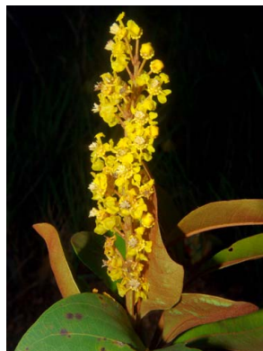
38 Byrsonima crassifolia