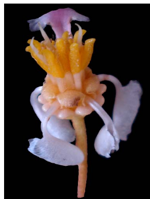
29 Byrsonima coccolobifolia