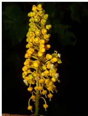
41 Byrsonima crispera