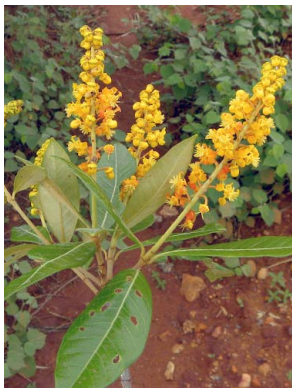
106 Byrsonima sericea