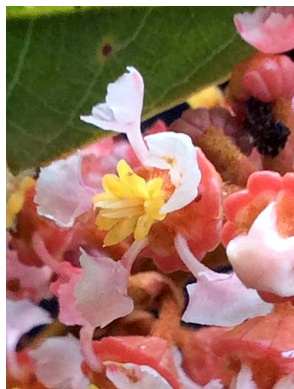
32 Byrsonima coniophylla