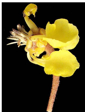
74 Byrsonima linearifolia