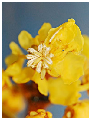
39 Byrsonima crassifolia