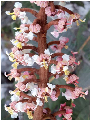
81 Byrsonima macrophylla