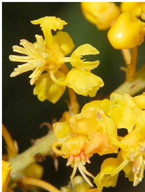
111 Byrsonima spicata