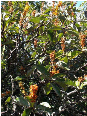
91 Byrsonima pachyphylla