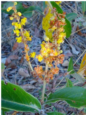
92 Byrsonima pachyphylla