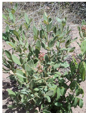
34 Byrsonima correifolia