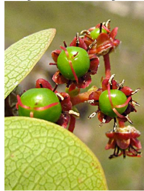
124 Byrsonima triopterifolia