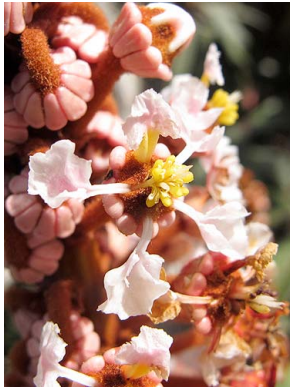
82 Byrsonima macrophylla