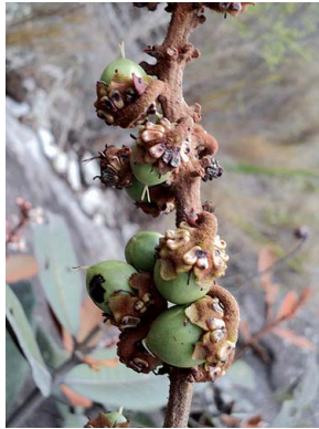
83 Byrsonima macrophylla