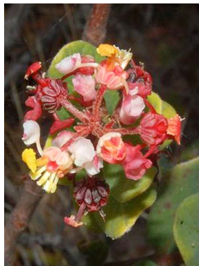
89 Byrsonima microphylla