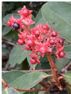
33 Byrsonima coniophylla