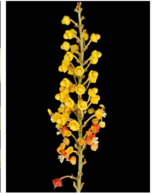
5 Byrsonima arthropoda