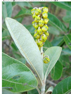
44 Byrsonima cydoniifolia