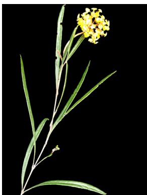
72 Byrsonima linearifolia