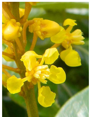
120 Byrsonima stipulacea