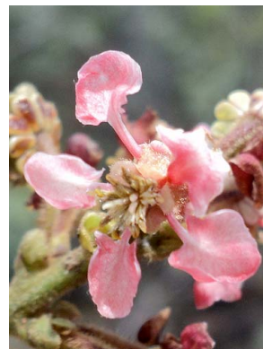
35 Byrsonima correifolia