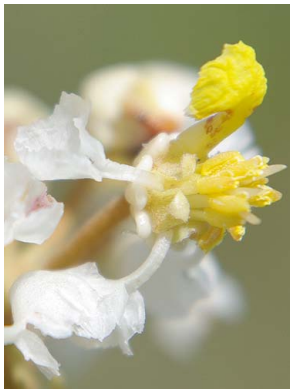
12 Byrsonima brachybotrya