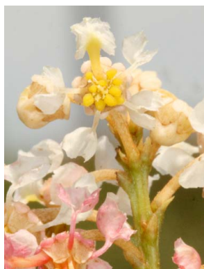
71 Byrsonima ligustrifolia