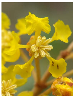
47 Byrsonima cydoniifolia