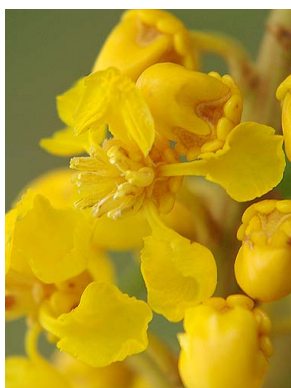
68 Byrsonima laxiflora