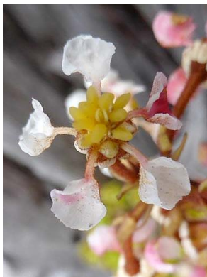
16 Byrsonima chalcophylla