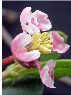
123 Byrsonima triopterifolia