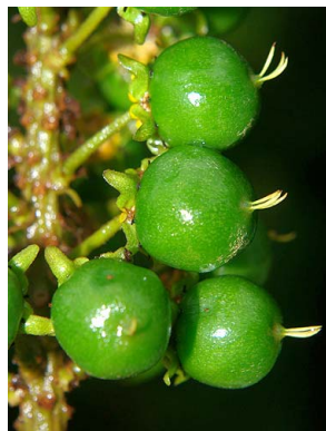
43 Byrsonima crispera