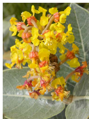
50 Byrsonima dealbata