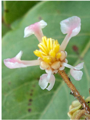
103 Byrsonima rotunda