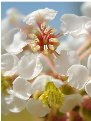
127 Byrsonima umbellata