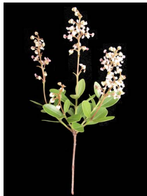
128 Byrsonima vacciniifolia