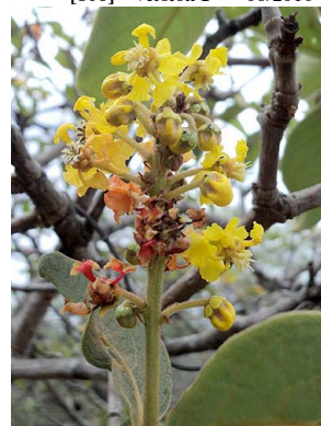
25 Byrsonima clauseniana