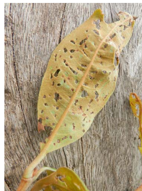
19 Byrsonima chrysophylla