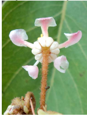
104 Byrsonima rotunda