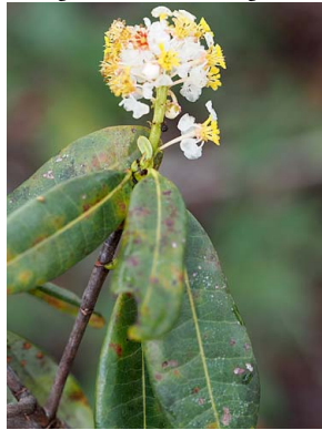
84 Byrsonima melanocarpa