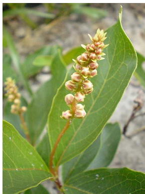
98 Byrsonima rigida