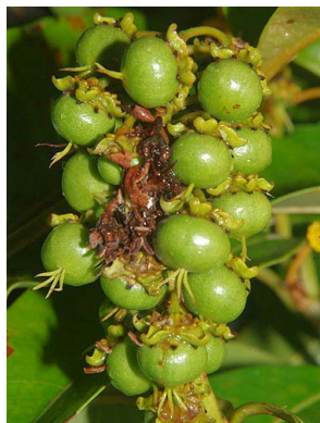
21 Byrsonima chrysophylla

Research support from CAPES and CNPq. This study is part of the doctoral thesis of the first author at the Instituto de Botânica. [fieldguides.fieldmuseum.org] [806] version 1 08/2016