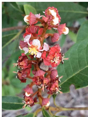
31 Byrsonima coniophylla