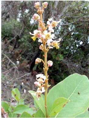
101 Byrsonima rotunda

Research support from CAPES and CNPq. This study is part of the doctoral thesis of the first author at the Instituto de Botânica. [fieldguides.fieldmuseum.org] [806] version 1 08/2016