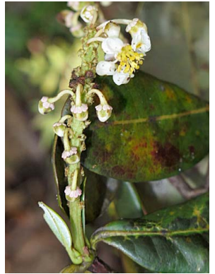
85 Byrsonima melanocarpa