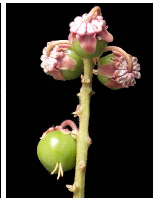
130 Byrsonima vacciniifolia