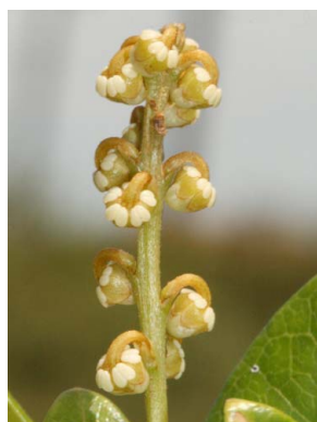
70 Byrsonima ligustrifolia