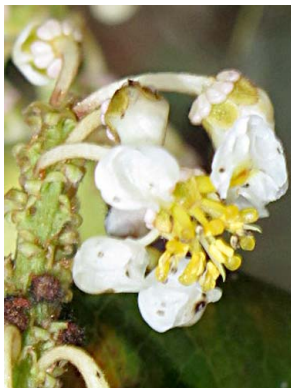
86 Byrsonima melanocarpa