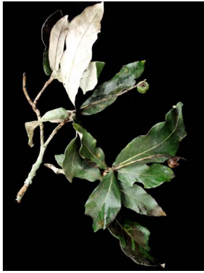
1 Byrsonima affinis

Research support from CAPES and CNPq. This study is part of the doctoral thesis of the first author at the Instituto de Botânica. [fieldguides.fieldmuseum.org] [806] version 1 08/2016