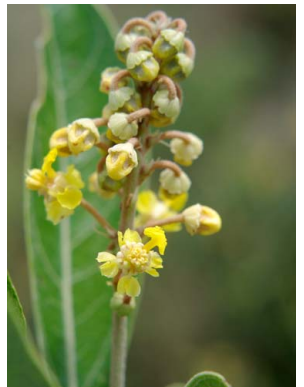
95 Byrsonima psilandra