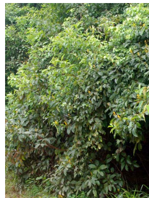
40 Byrsonima crispa