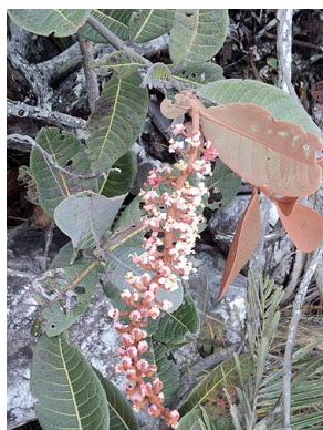
79 Byrsonima macrophylla