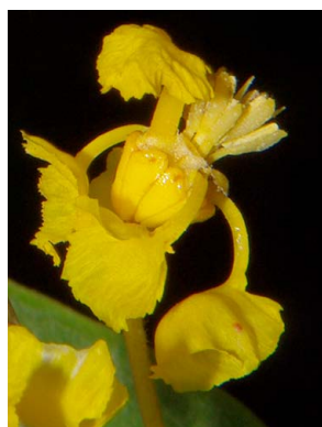
48 Byrsonima cydoniifolia