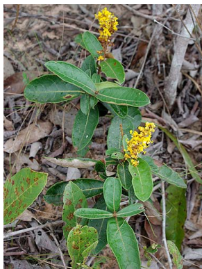
63 Byrsonima lanulosa