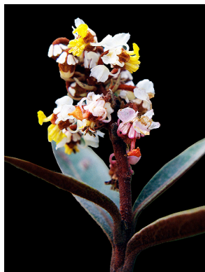
22 Byrsonima cipoensis