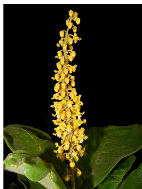
75 Byrsonima linguifera