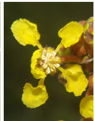
140 Byrsonima viminifolia