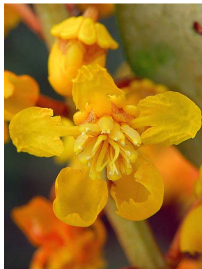
109 Byrsonima sericea