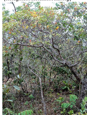
24 Byrsonima clauseniana