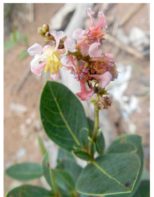
100 Byrsonima rigida