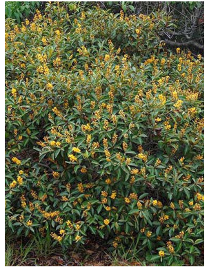
105 Byrsonima sericea