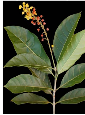
4 Byrsonima arthropoda