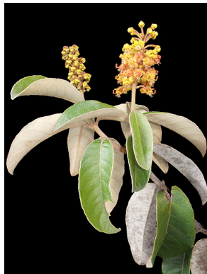
114 Byrsonima stannardii