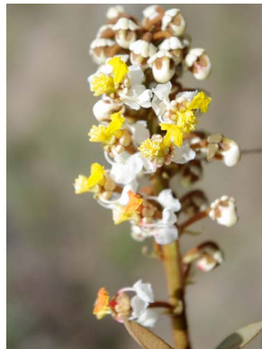
133 Byrsonima variabilis