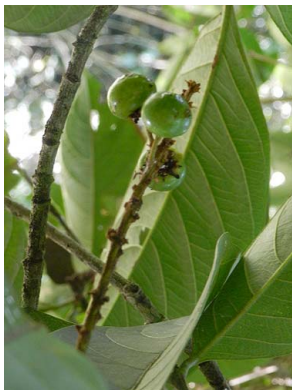
6 Byrsonima arthropoda