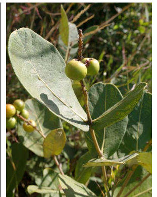
10 Byrsonima basiloba