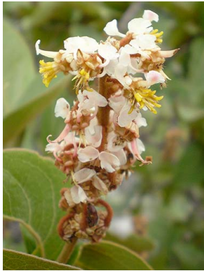
102 Byrsonima rotunda