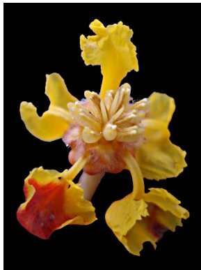
93 Byrsonima pachyphylla