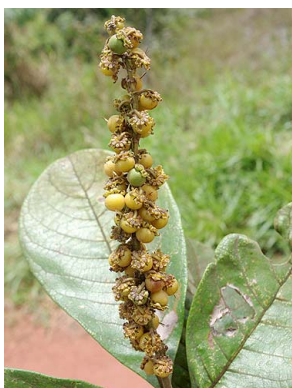
77 Byrsonima linguifera