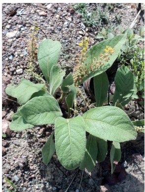
136 Byrsonima verbascifolia