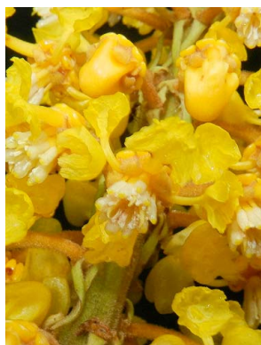
76 Byrsonima linguifera