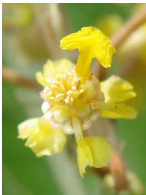
96 Byrsonima psilandra