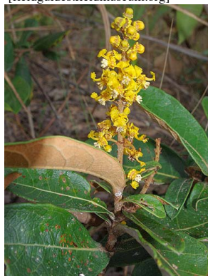
64 Byrsonima lanulosa