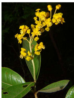
46 Byrsonima cydoniifolia