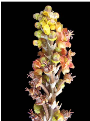
7 Byrsonima basiloba