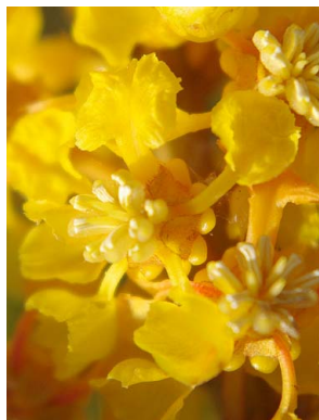
61 Byrsonima intermedia

Research support from CAPES and CNPq. This study is part of the doctoral thesis of the first author at the Instituto de Botânica. [fieldguides.fieldmuseum.org] [806] version 1 08/2016