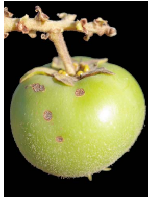
3 Byrsonima affinis