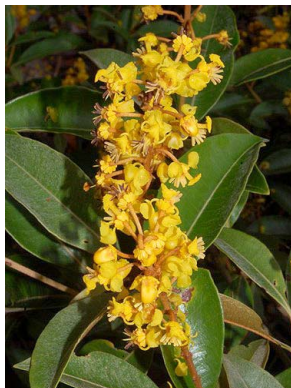
108 Byrsonima sericea