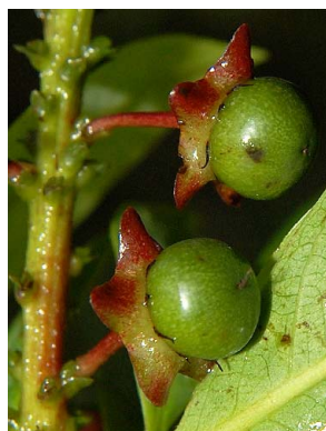
58 Byrsonima incarnata