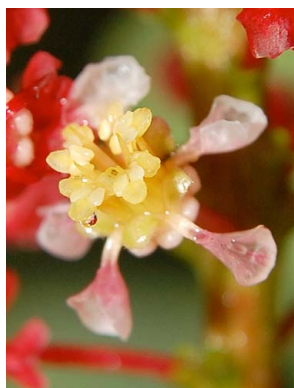
57 Byrsonima incarnata