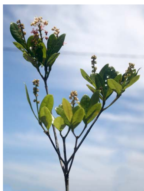
69 Byrsonima ligustrifolia