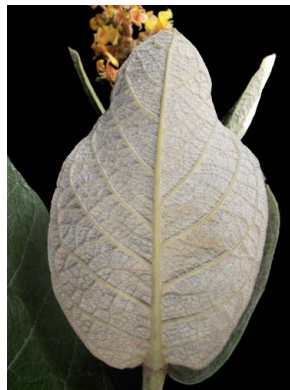
8 Byrsonima basiloba