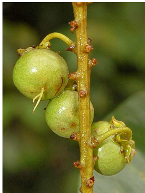
113 Byrsonima spicata