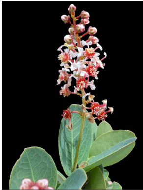
122 Byrsonima triopterifolia