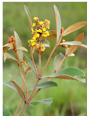
139 Byrsonima viminifolia