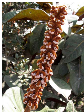
80 Byrsonima macrophylla