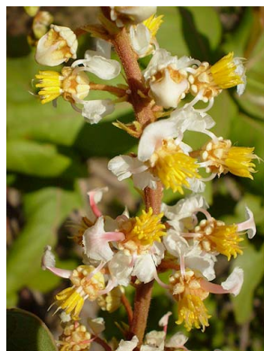
28 Byrsonima coccolobifolia