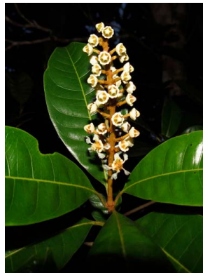
13 Byrsonima cacaophila