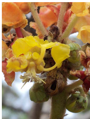
26 Byrsonima clauseniana