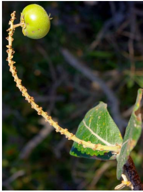
2 Byrsonima affinis