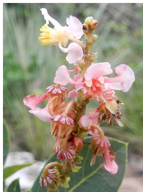
99 Byrsonima rigida