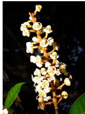
14 Byrsonima cacaophila