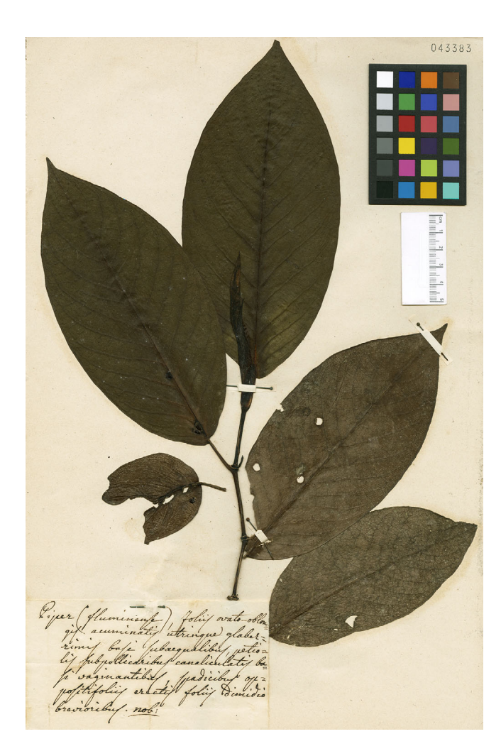
Fig. 1. Lectotype of Piper fluminense Raddi at PI (sheet no. 1, Acc. No. 043383). The label is handwritten by Raddi.

The illegitimate later homonym Piper fluminense C.DC. is a synonym of Manekia obtusa (Miq.) T.Arias & al. (Arias & al., 2006).