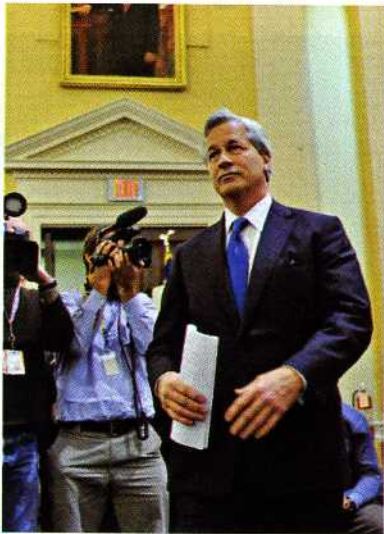
🚩 JPMorgan Chase CEO Dimon in D.C.