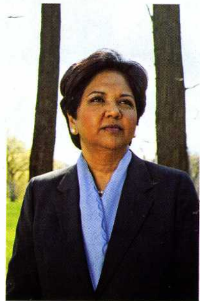
🚩 Pepsi CEO Nooyi’s good-for-you agenda