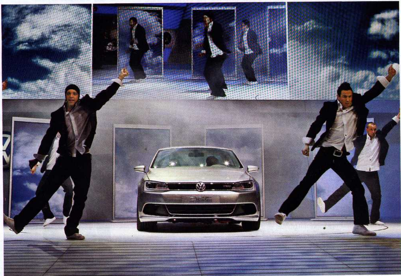
▲ Volkswagen unveils its New Concept Coupe at the Detroit auto show