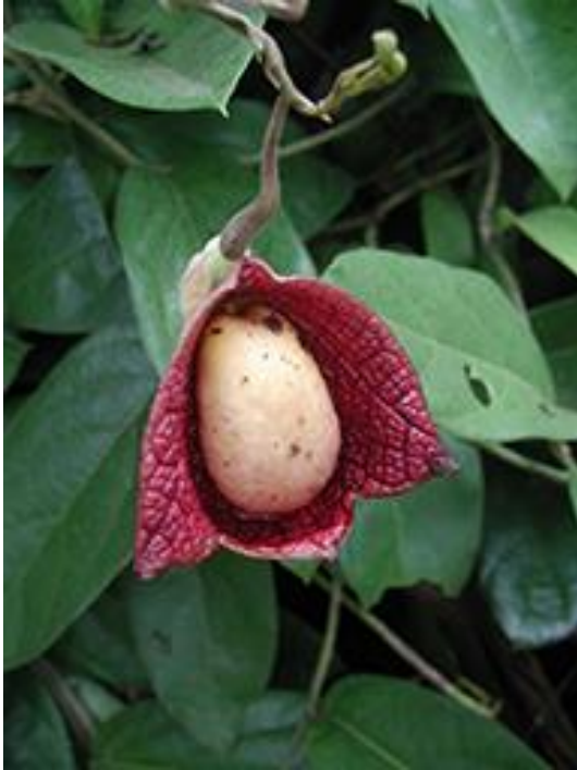
Isotrema veracruzana , photo by J. Meerman.

Twining lianas, erect shrubs or small rhizomatous herbs; bark corky and fissured. Leaves