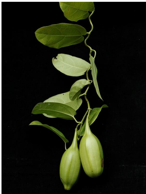
Aristolochia sp.

Twining vines or lianas, herbaceous or commonly woody (Figure 15). Stems cylindrical,