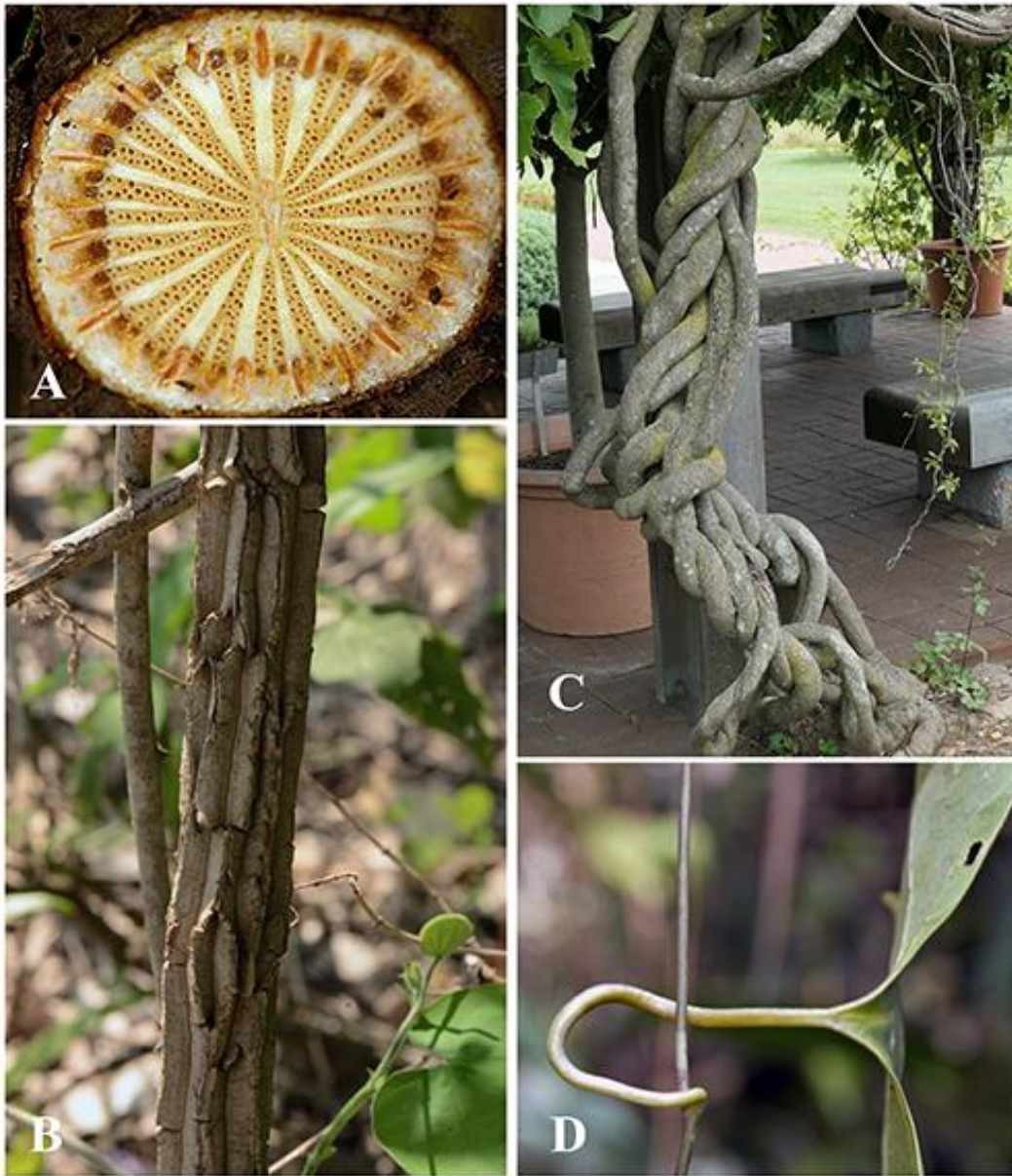
Figure 13. Stems in species of Aristolochia . A. Cross section of A. maxima , showing wide rays dividing the vascular axial elements into radial segments and vessel elements with very wide lumen. B. Corky, fissured bark of A. elegans . C. Aristolochia sp. showing twining stems. D. Aristolochia sp. with recurved petioles.