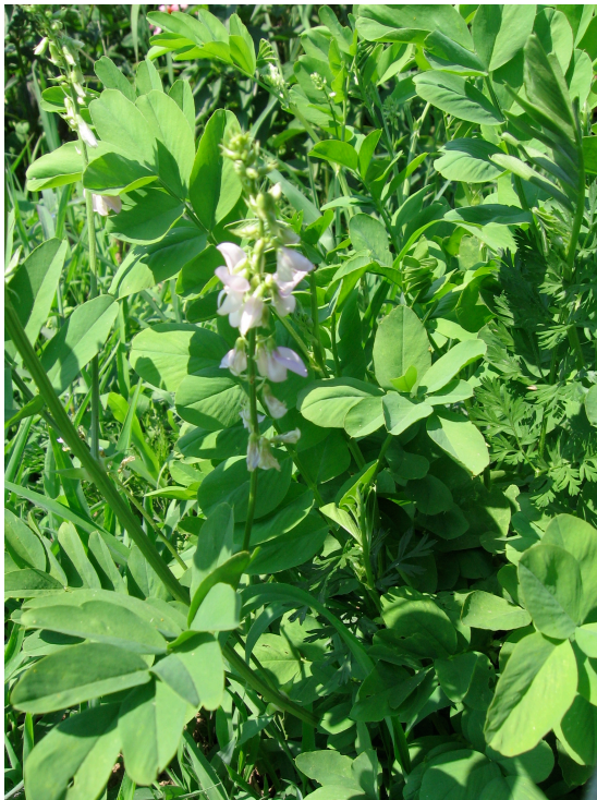
Goatsrue flowering plant, Photo by Bob Barrett, ODA

Findings of This Review and Assessment: Goatsrue, Galega officinalis , was evaluated and determined to be a category “ A ” rated noxious weed, as defined by the Oregon Department of Agriculture (ODA) Noxious Weed Policy and Classification System. This determination was based on a literature review and analysis using two ODA evaluation forms. Using the Noxious Qualitative Weed Risk Assessment v.3.8, goatsrue scored 64 indicating a Risk Category of A ; and a score of 18 with the Noxious Weed Rating System v.3.2, indicating an “ A ” rating.