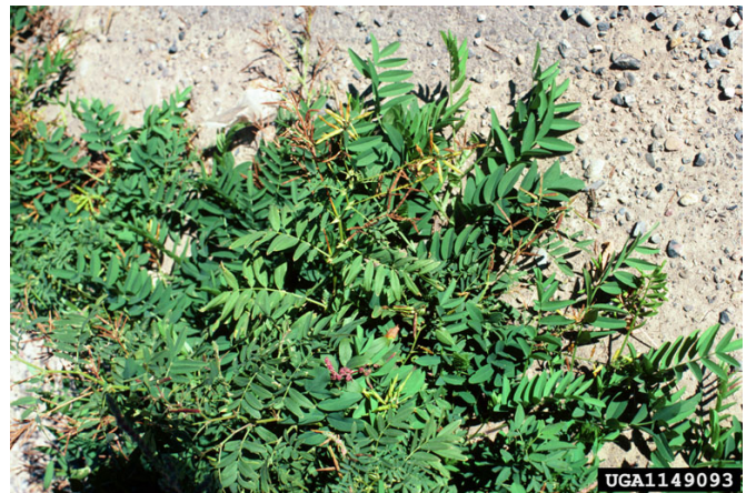
Goatsrue plant

Introduction: Goatsrue, Galega officinalis , is a USDA federally listed noxious weed. A member of the legume family, goats rue was introduced into Utah in 1891 as a potential forage crop. Escaping cultivation, it now occupies in excess of 60 square miles in Cache, County, Utah. Within this area, goatsrue infests cropland, fence lines, pastures, roadsides, waterways, and wet, marshy areas (Evans and Ashcroft 1982). The plant's stems and leaves contain a poisonous alkaloid, galegin, which renders the plant unpalatable to livestock, and toxic in large quantities. It is particularly lethal to sheep. Because of these issues, goatsrue invasion can reduce forage availability and quality.