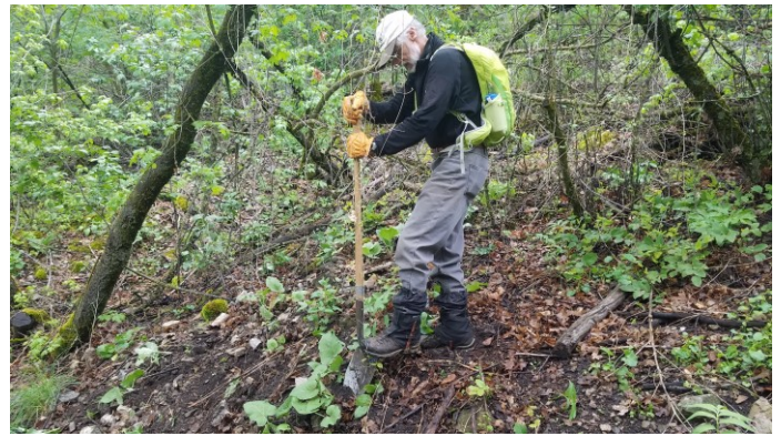
Digging burdock along the River Trail