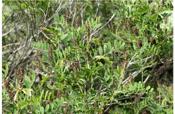
Amorpha fruticosa leaves and flowers.

This species along with A. nana was collected on the Lewis and Clark expedition. They likely also observed A. canescens . All three species are widely distributed in the Great Plains. In fact, A. fruticosa was likely originally restricted to the Great Plains. Yet Linneaus knew about