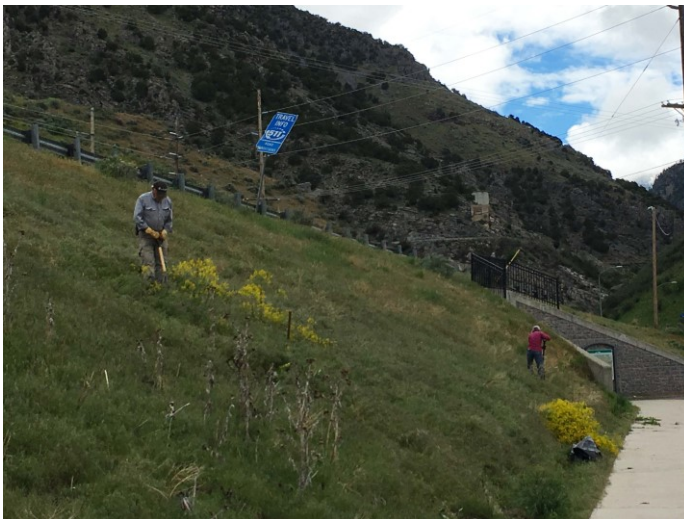
Digging dyers woad and Scotch thistle from the slope between US-89 and Canyon Road