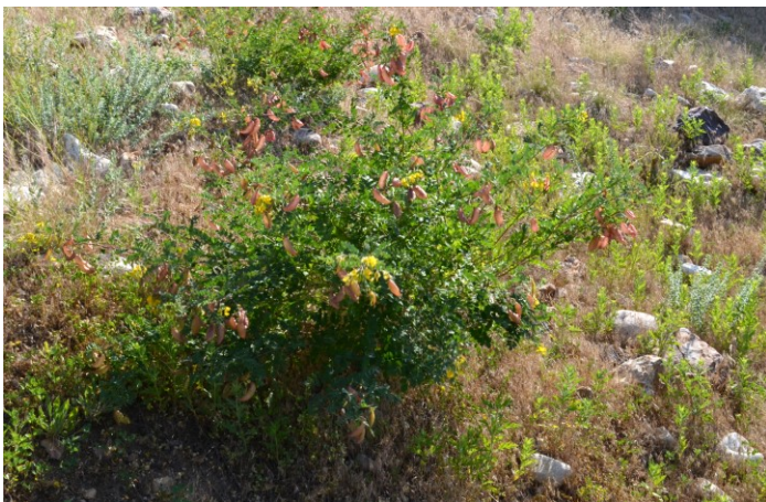
Colutea arborescens , flowers, fruits and form.

Sanpete County growing at an elevation of 7500 ft. in 1981.