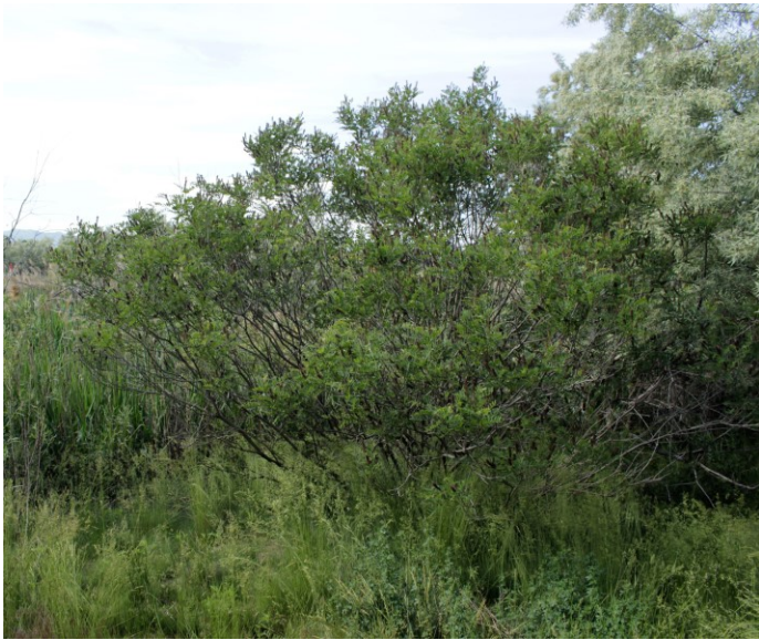
Amorpha fruticosa as a tree.

A thick and largely impenetrable stand of the Jordan River's ubiquitous invasive Phragmites australis subsp. australis was nearby.