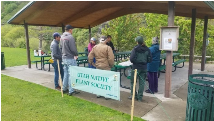
Weed orientation at the Canyon Entrance (First Dam Park pavilion)

by David Wallace, UNPS Invasive Species Committee