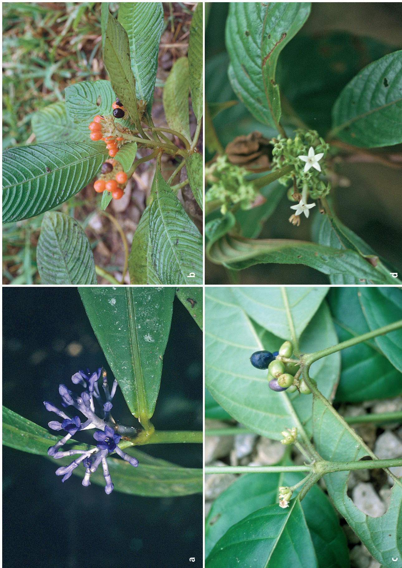
Plate 2: (a) Faramea suerrensis , (b) Notopleura polyphlebia (syn. Psychotria polyphlebia ), (c) Ronabea latifolia (syn. Psychotria erecta ), (d) Sabicea panamensis