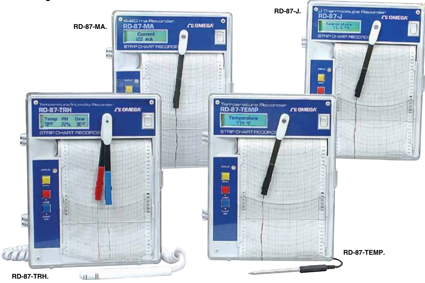
All models shown smaller than actual size.