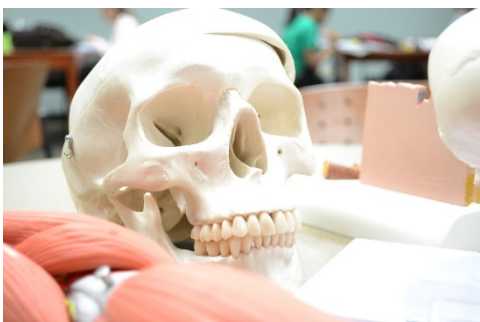
Galen College of Nursing | Cincinnati Campus

Repeated courses may be at the student's expense, upon reentry. All decisions will be made final at the discretion of the Program Director. Please refer to the Transfer Policies Section for additional information regarding general education course credits.