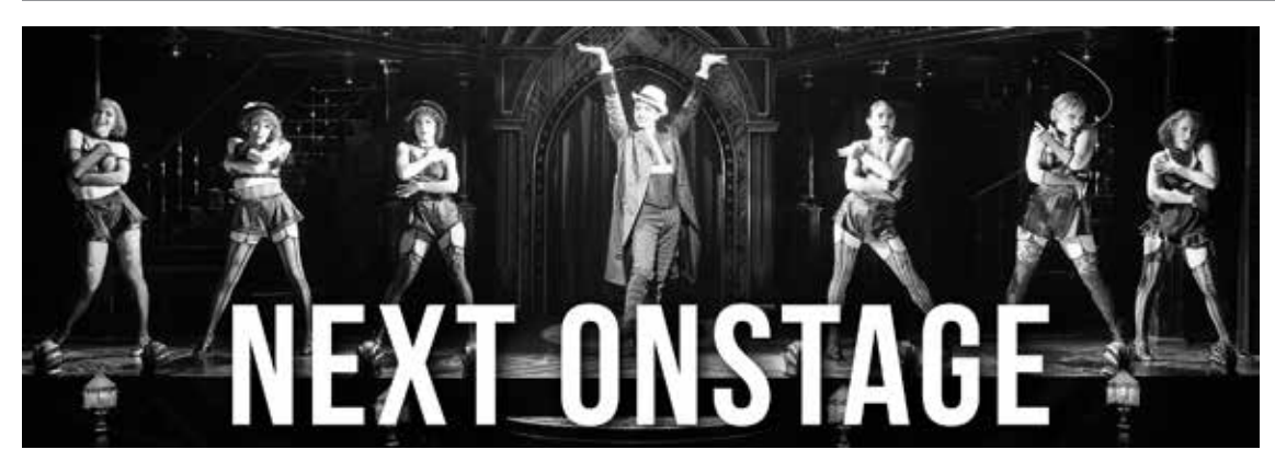
The cast of Cabaret at Asolo Repertory Theatre.